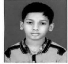
Passport Size Photo